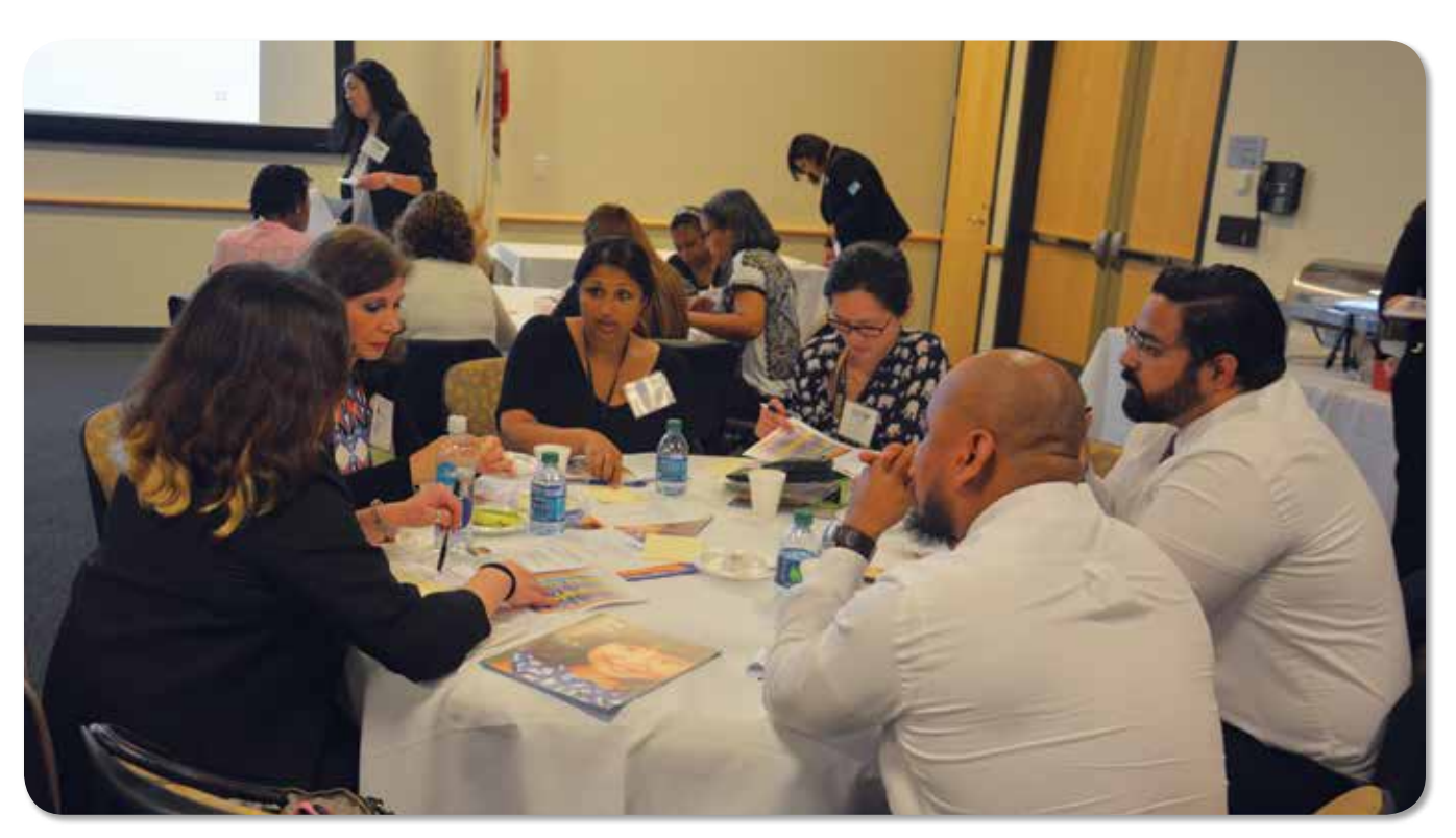
Coming together to discuss community health needs

The hospital's Community Benefit Advisory Committee, community leaders, representatives and residents participated in this process. CHLA is currently conducting the 2016 Community Health Needs Assessment and developing our FY 2016-18 Community Benefit Implementation Strategy.