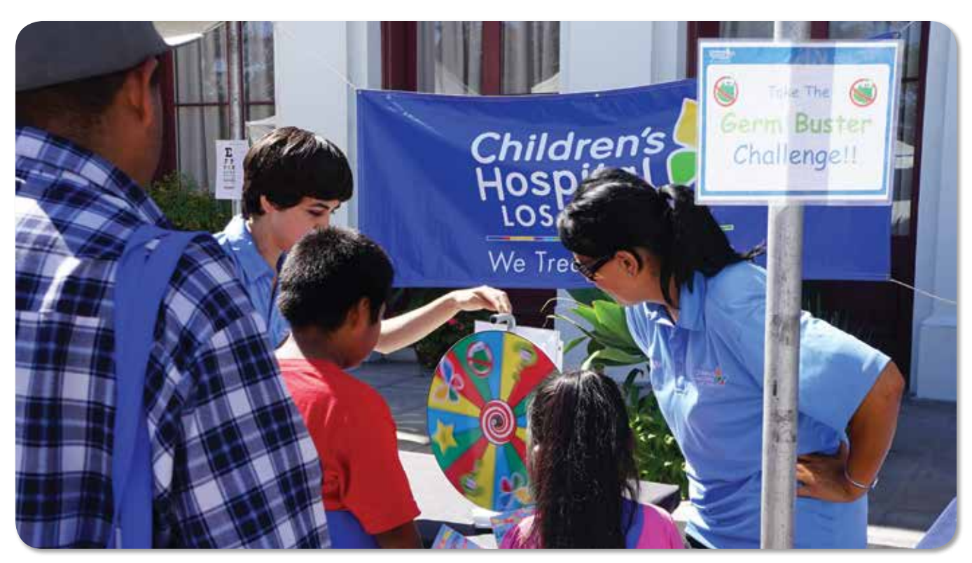
CHLA staff conducting outreach and providing education out in the community.