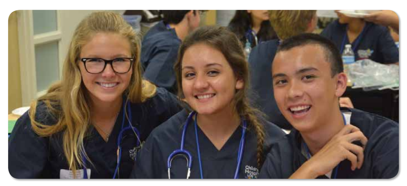
CAMP CHLA student participants